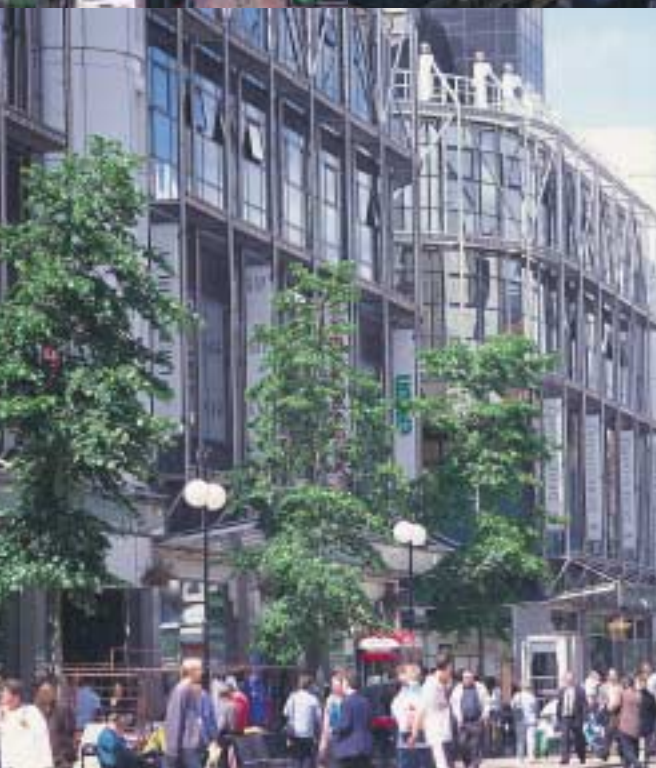
The modern Castle Court shopping centre in Royal Avenue.

On the river, the £750 million Lagan side redevelopment project is one of the most ambitious in the UK with hotels, offices, riverside apartments, new bridges and the Waterfront Hall, a concert and conference venue. Lagan side's dominant attraction is the Odyssey complex, home to the W5 interactive discovery centre, a 10,000-seat arena, cinema, restaurants and bars.