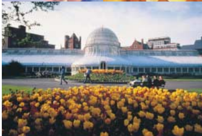
The Botanic Gardens, close to Queen's University, provide a tranquil and colourful haven in the midst of the city.