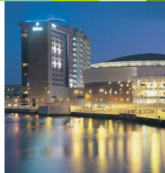
The Waterfront Hall, Belfast's foremost conference and concert venue, was recently world-wide runner-up in the Association of Conference Centres' Apex Awards. Conferences are one of Belfast's greatest tourist growth areas.

New technology to develop electronics, computer software, medical equipment, textiles and aerospace components has been harnessed by Belfast's many modern businesses. Health services, distribution, public administration, business services, manufacturing, education, tourism and transport are the main areas of employment.