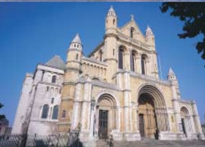
St Anne's Cathedral was partly completed and opened in the 1890s, but only finished almost a century later. Inside are some wonderful mosaics, including one with over 150,000 pieces.