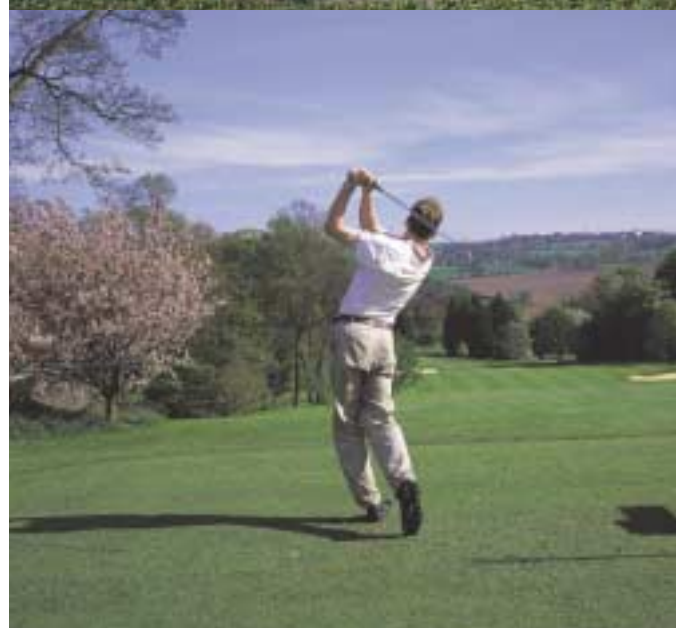
Golf-players have no shortage of courses on which to practise their 'swing'. There are ten courses within the city boundary.

BELFAST PEOPLE love to celebrate, and so enjoy the many entertainment and sports festivals. Most famous of the 13 annual arts events is the Belfast Festival which has been a showcase of outstanding international talent for more than 40 years. Feile an Phobail in West Belfast claims to be Europe's largest community festival. The Cathedral Quarter Arts Festival is at the cutting edge of contemporary arts.