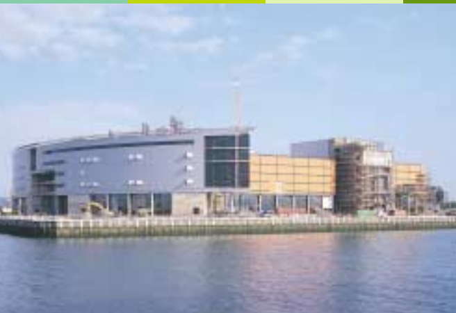
The huge £91 million Odyssey complex, seen here under construction. It contains the largest indoor arena in Northern Ireland where a wide range of events are staged, including indoor athletics, boxing championships and rock concerts.