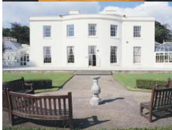
Malone House, an elegant 19th century mansion in South Belfast, houses the Higgin Art Gallery.