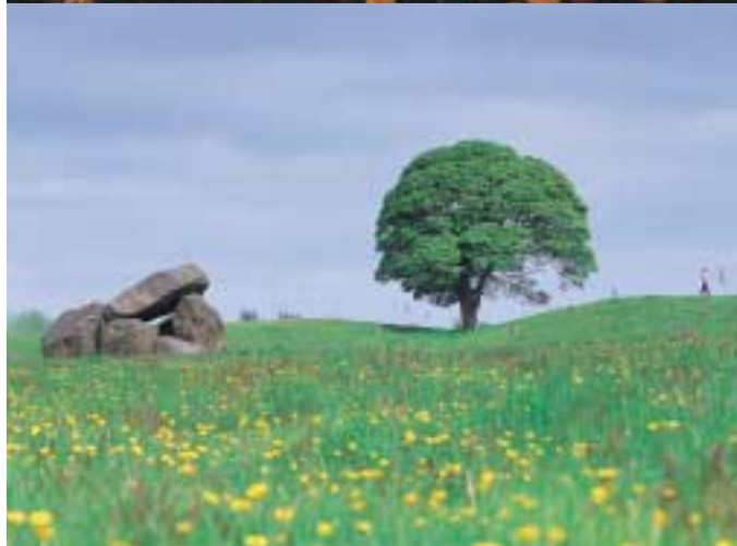
The Giant's Ring is a mysterious site estimated by some to be 4000 years old. From the embankment there are splendid views across the Lagan Valley towards the Belfast Hills.

Belfast City Council is the largest of Northern Ireland's 26 local government authorities. It provides a huge range of services, from leisure centres and parks to waste recycling. The Chief Executive is responsible to a Council of 51 members who are elected every four years and reflect the city's diversity of political and religious affiliations.