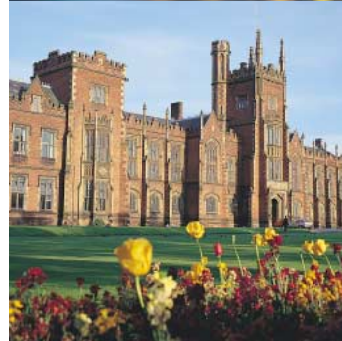
The original Tudor-style red and yellow brick building of Queen's University was designed by Sir Charles Lanyon. Belfast's great architect of the Victorian Age. Since it was founded in 1845, the university's estate has grown to more than 300 buildings.