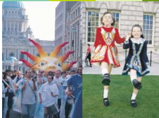
The city holds no fewer than 13 annual arts events and the Belfast Carnival Parade is one of the most popular events on the calendar.

Rose lovers delight in the summer Rose Week when Belfast International Rose Garden displays a half-million blooms of every shade and shape, confirming why Northern Ireland has been a world centre of rose expertise for generations. The colourful Botanic Gardens with its magnificent Palm House and Tropical Ravine brings the exotic to the city, while Cave Hill Country Park with its spectacular views and nesting falcons, is a favourite haunt of wildlife enthusiasts.