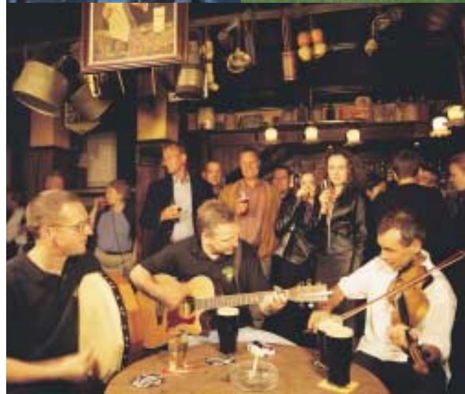
Belfast nightlife ranges from throbbing dance clubs to more intimate pubs where drinkers enjoy the soothing sounds of traditional Irish ballads.