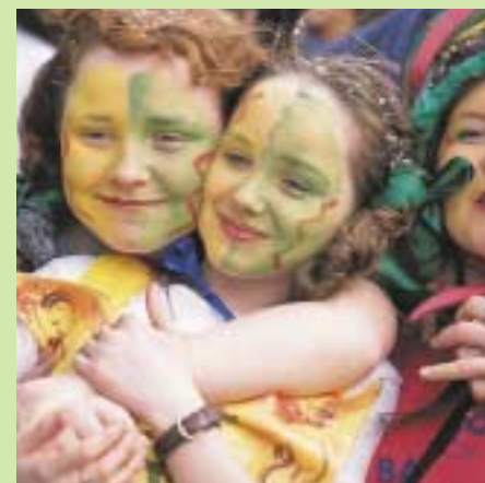
Bottom: Tourists and locals alike crowd onto the streets at festival-time.