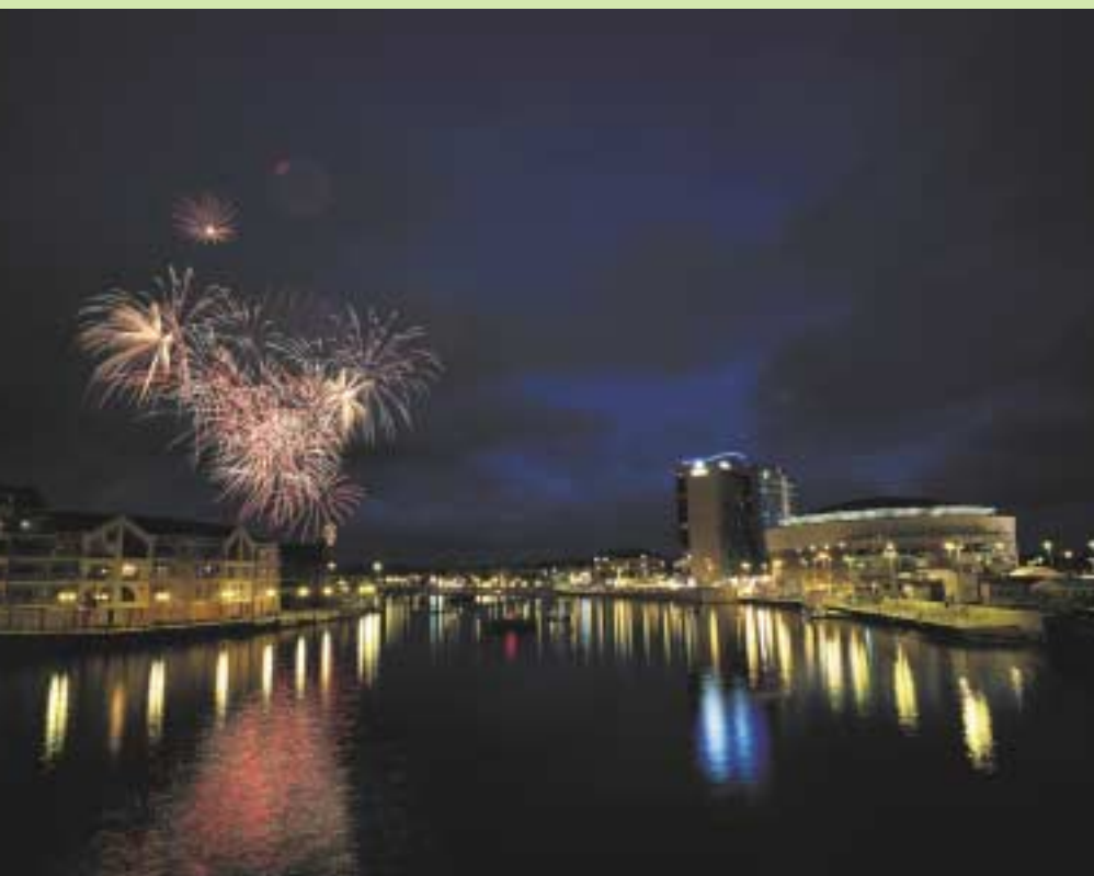
Left: Belfast is a city of festivals and celebrations. Amazing firework displays often light up the night sky.