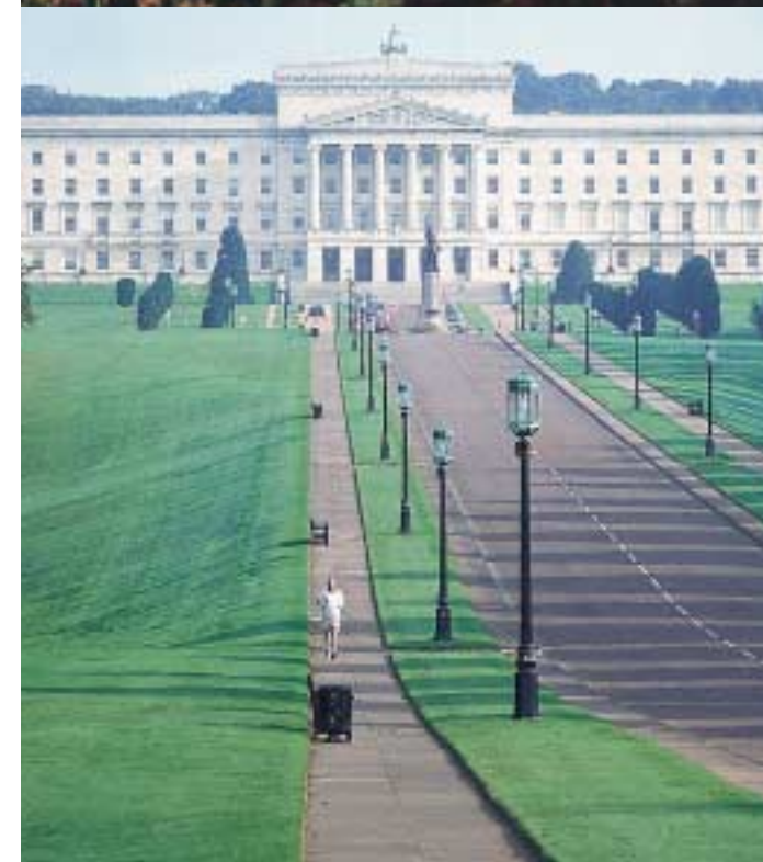
Majestic Stormont stands at the top of a 1.6 km avenue bordered by parkland. It was designed to house the Northern Ireland Parliament.

The city's many corporate overseas investors benefit from competitive costs, good communications and well-educated staff, while tourism contributes more than £114 million annually to Belfast's economy.