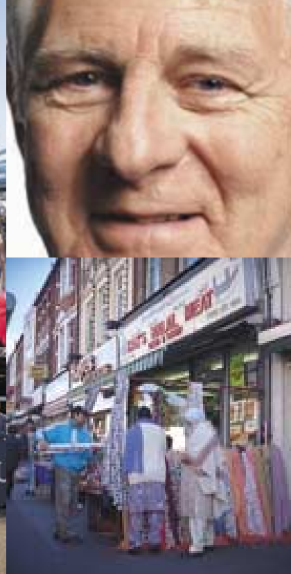
TOP LEFT: © Foreign & Commonwealth Office TOP RIGHT: © PhotoDisc BOTTOM LEFT: © Foreign & Commonwealth Office BOTTOM RIGHT: © Michael Nicholson