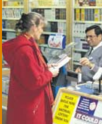
TOP LEFT: © PhotoDisc BOTTOM LEFT: © Foreign & Commonwealth Office RIGHT: © London Picture Service / Foreign & Commonwealth Office