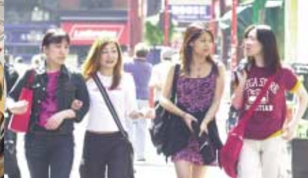
TOP LEFT & RIGHT: © Overseas Press and Picture Service / Foreign & Commonwealth Office BOTTOM LEFT: © London Picture Service / Foreign & Commonwealth Office BOTTOM RIGHT: © Patrick Tsui